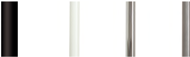
Black epoxy (RAL 9005)