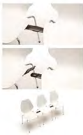
City with linking device