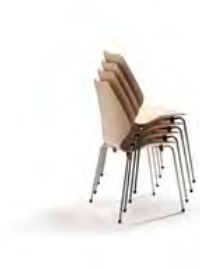
City Original stacks 11 pcs.